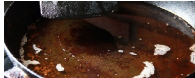
Used cooking oil