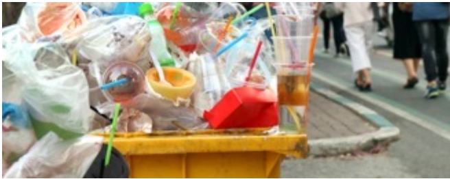
Mixed plastic waste